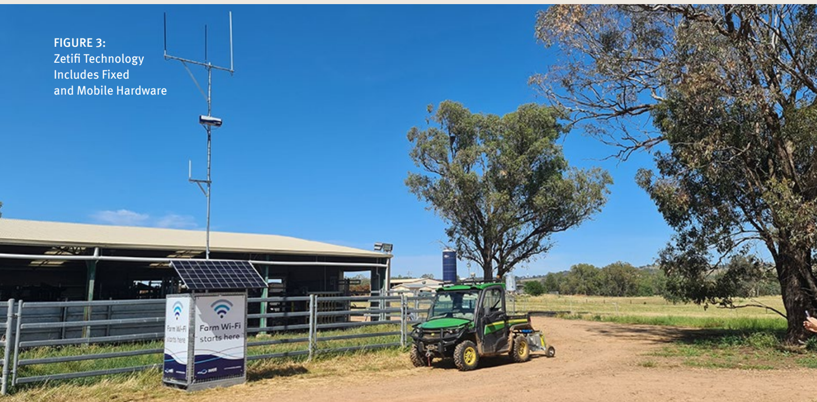
FIGURE 3: Zetifi Technology Includes Fixed and Mobile Hardware

When used together, a Zeticell is capable of transmitting Wi-Fi signals up to 3km to a receiving ZetiRover.