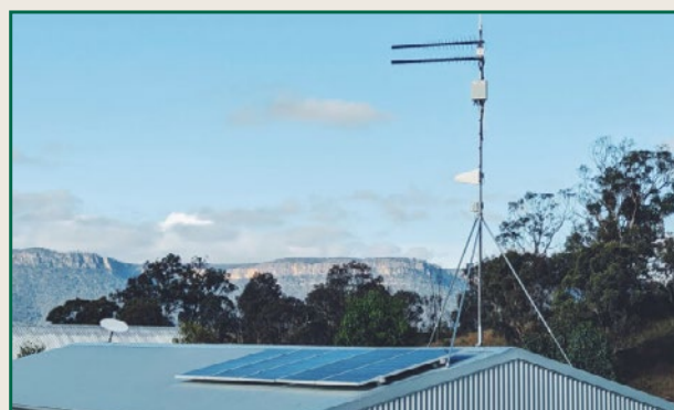
FIGURE 8: A Raised ZetiCell Installation

After a successful feasibility study in 2021, Zetifi are also delivering a demonstration of its 'ZetiNet' platform in NSW, Australia. ZetiNet is an integrated and scalable public Wi-Fi application of the ZetiCell and ZetiRover products that extends the benefits of Zetifi's technology beyond an individual farm, offering a scalable solution for region-wide connectivity.