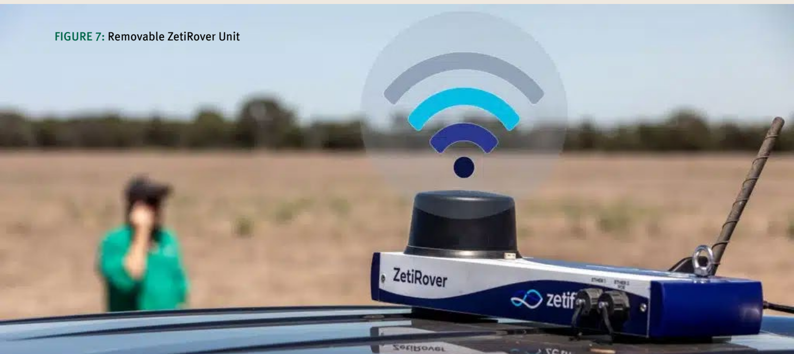
FIGURE 7: Removable ZetiRover Unit