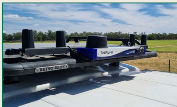
FIGURE 1: A mobile ZetiRover Installation

Zetifi’s technology eliminates communication and connectivity ‘dead spots’ in remote locations by extending the reach of existing networks. The technology consists of both fixed and mobile devices that enable farmers to communicate from remote points on their property. Zetifi operates from Wagga Wagga, Australia and since its inception in 2017, has expanded to support a network of national and international outlets.