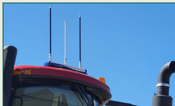
FIGURE 6: A Solar Powered ZetiCell Installation

Once the hardware has been installed, growers will need to access Zetifi's 'plug and play' setup software, that enables connection between all the devices and to the selected 4G or satellite network. No specialised networking expertise is required to install and operate this system.