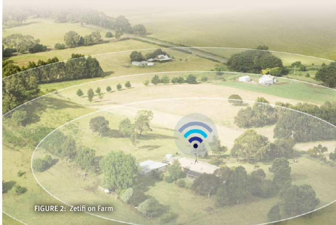
FIGURE 2: Zetifi on Farm